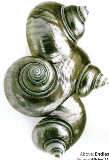
Above: Endless Love Below: White Mischief